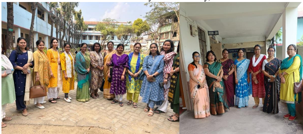
"Sucheta", the Women's cell at CACHAR COLLEGE, Silchar observed

8. Women's Cell "SUCHETA" constituted by female faculty, staffs and students.